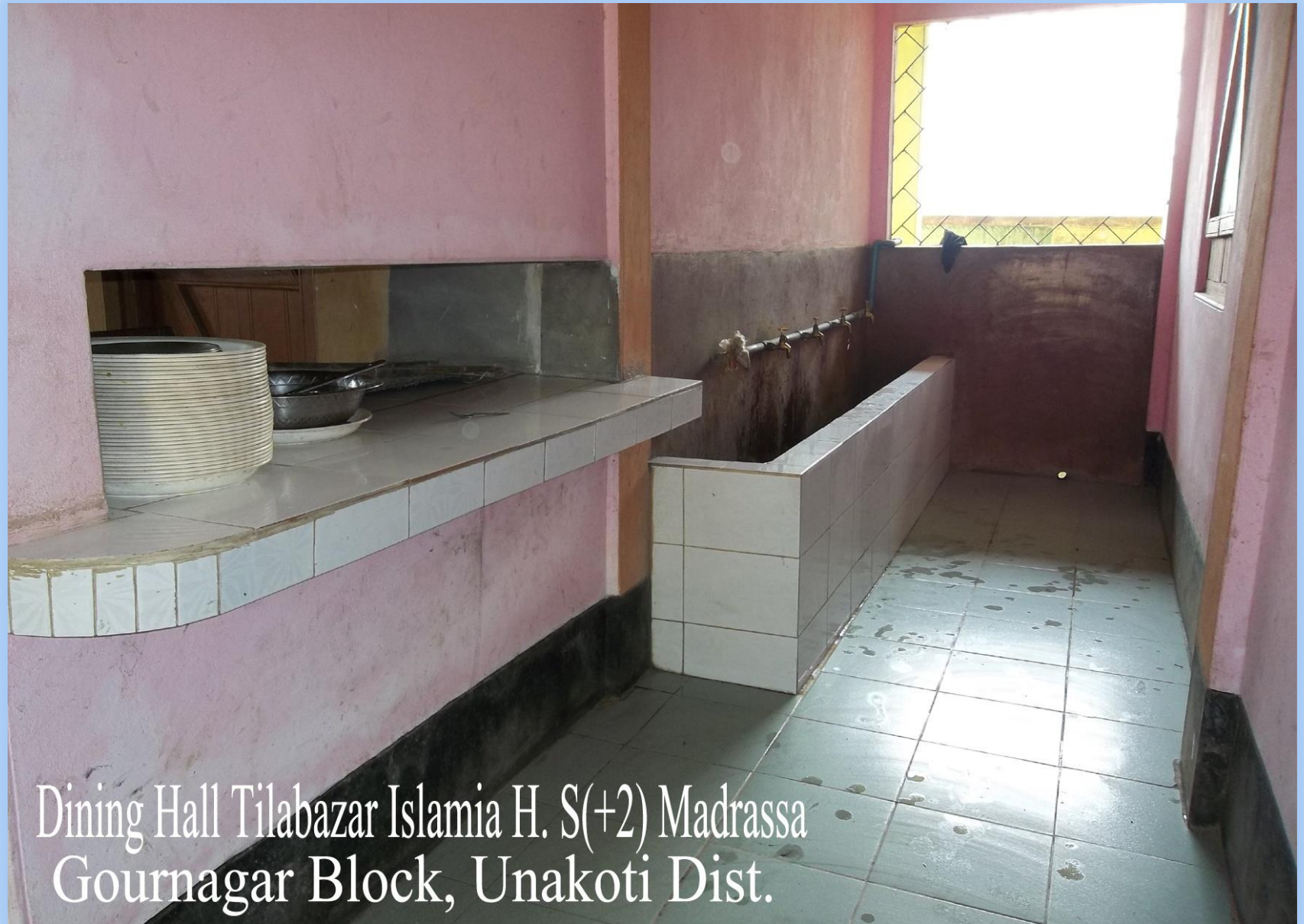
Dining Hall Tilabazar Islamia H. S(+2) Madrassa Gournagar Block, Unakoti Dist.