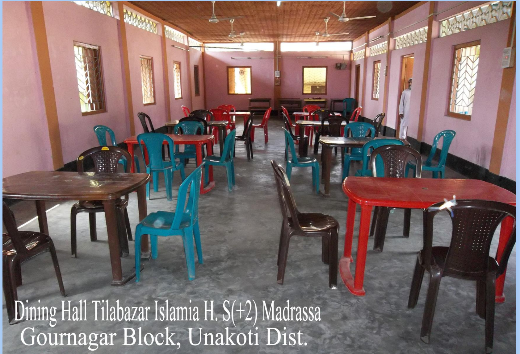
Dining Hall Tilabazar Islamia H. S(+2) Madrassa Gournagar Block, Unakoti Dist.